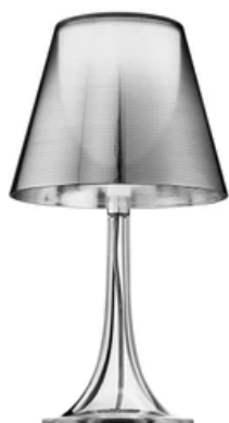
Table lamp providing diffused light. Fully transparent, injection-molded PMMA polymethylmethacrylate frame; opaline, injection-molded polycarbonate internal diffuser and injectionmolded transparent or colored polycarbonate external diffuser completely finished with high-vacuum aluminization process.